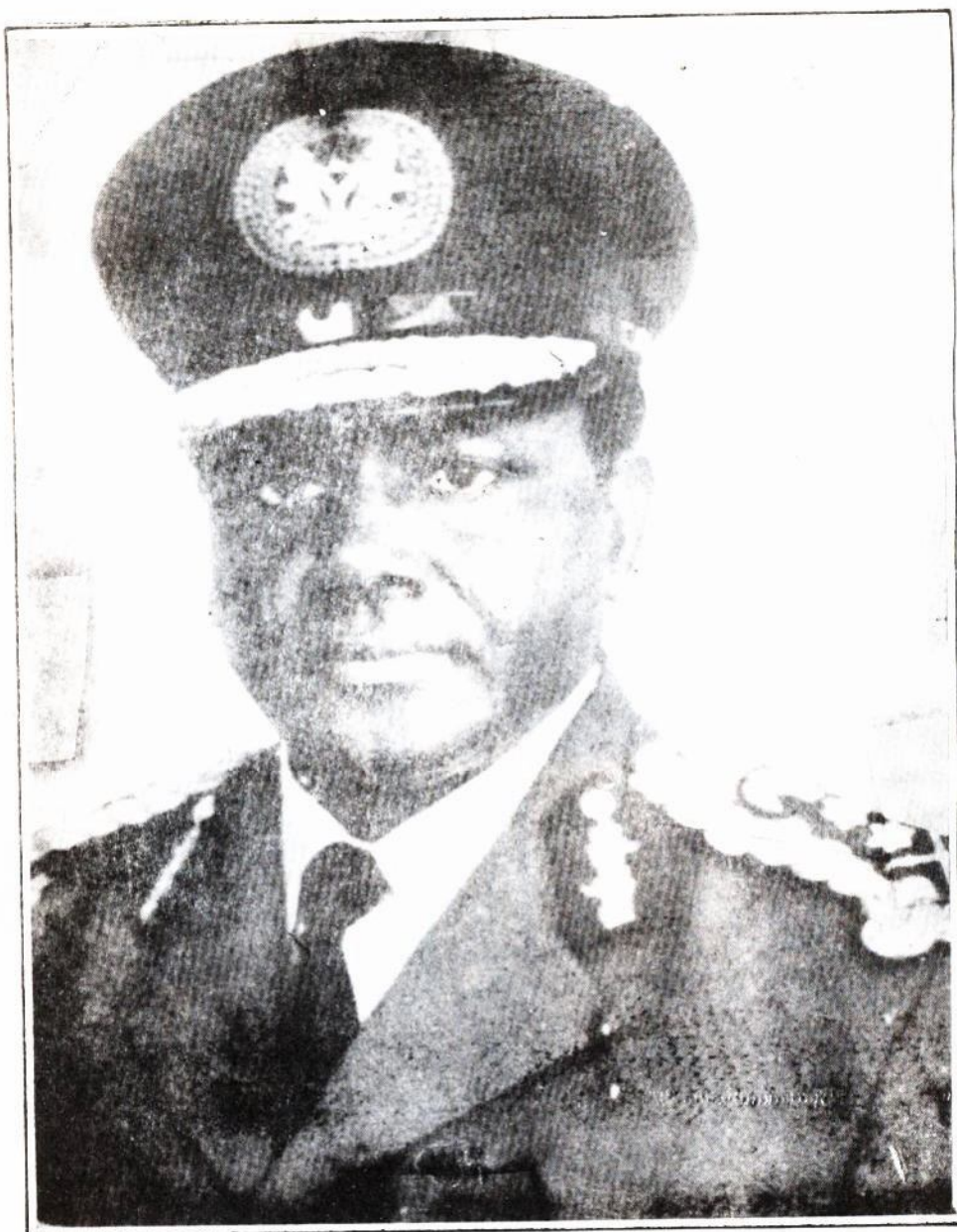
GENERAL SANI ABACHA, GCON. fss, psc, mni Head of State of the Federal Republic of Nigeria and Commander-in-Chief of the Armed Forces and Chairman Provisional Ruling Council.