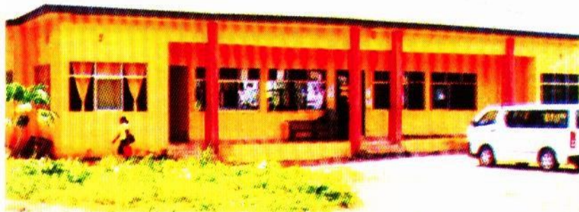
School of Agric & Agric Technology Lecture Theatre