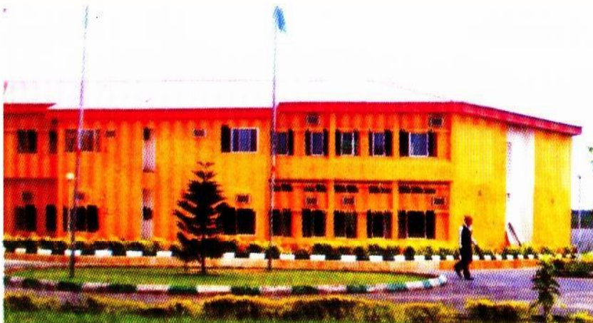
Senate Building Phase III