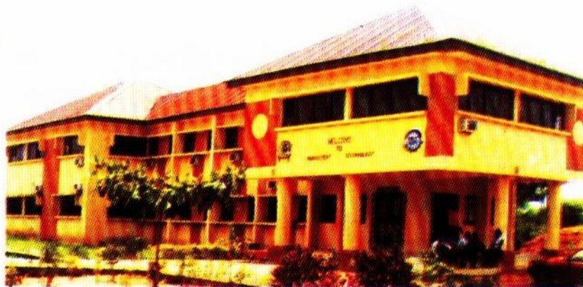
Project Management Building