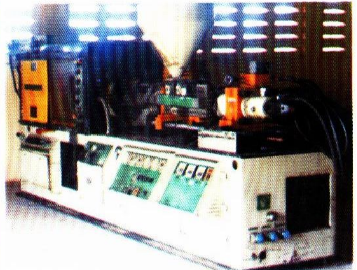
Injection moulding machine.