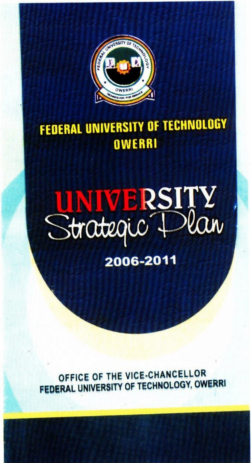
A 70-page Strategic Plan Document which guided my administration.