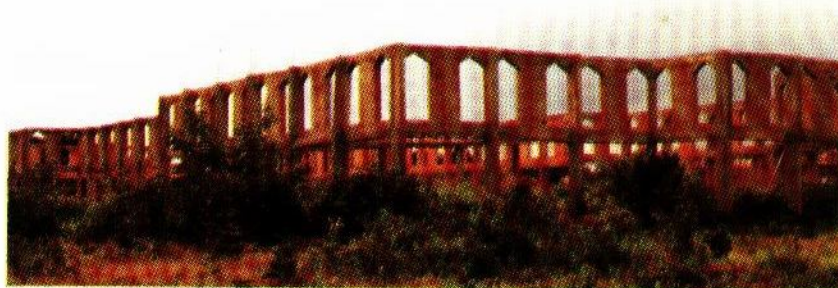
On-going Church building project of the All Saints Chapel, FUTO.