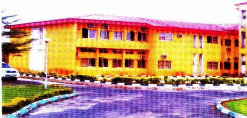
Senate Building Phase II