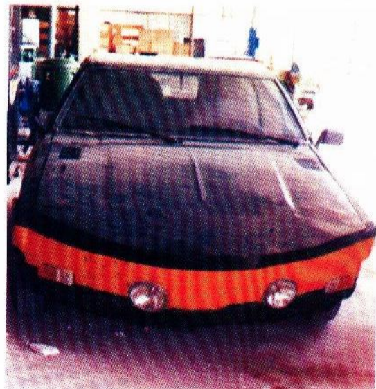
One of the two FUTO Formular 1 sports cars produced in 2008.