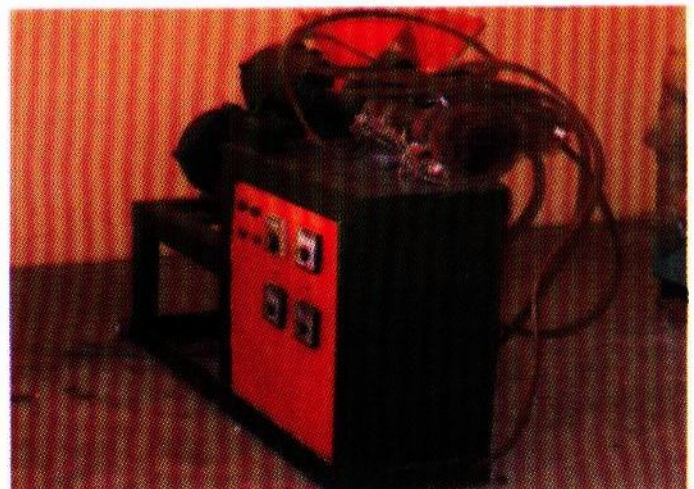
Extrusion machine fabricated by students for the production pipes.