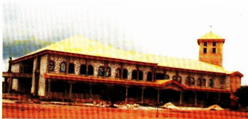
The St. Thomas Aquinas Catholic Chaplaincy (STACC) FUTO nearing completion.

Meanwhile the university allocated land to the Muslim community on which to build their Mosque.