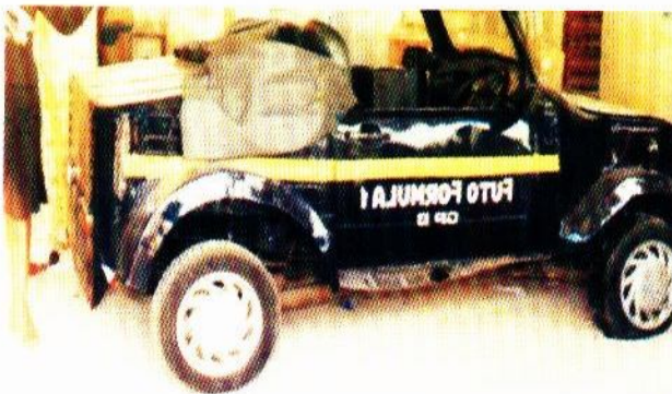
Side view of one of the FUTO Formula 1 sports cars.