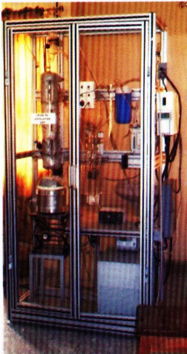
PET bottle blow moulding machine