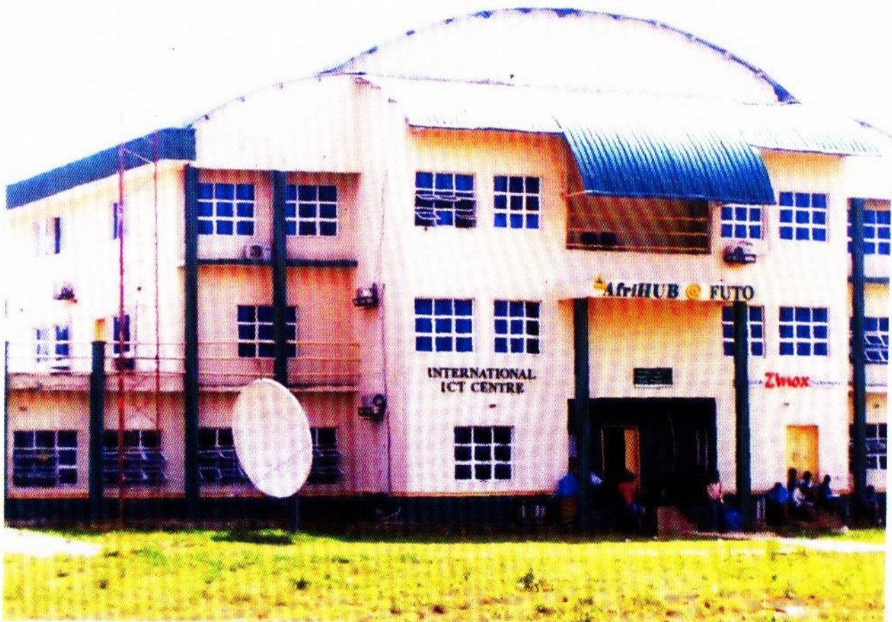
AfriHUB @ FUTO ICT Centre

The University Library also houses on-line resources and provides internet facilities.